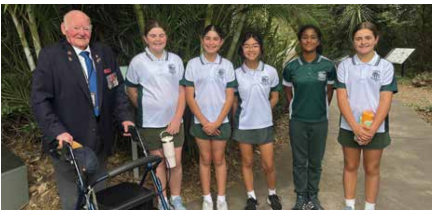
YEAR 6 STUDENTS FROM ST BERNARD'S SCHOOL, BOTANY, WITH SUPPORT FROM BOTANY RSL SUB-BRANCH

More and more community groups are booking tours of the Walkway, while the number of school pupils coming on organised visits is more than 4000 each year.