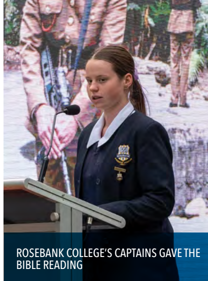
ROSEBANK COLLEGE'S CAPTAINS GAVE THE BIBLE READING