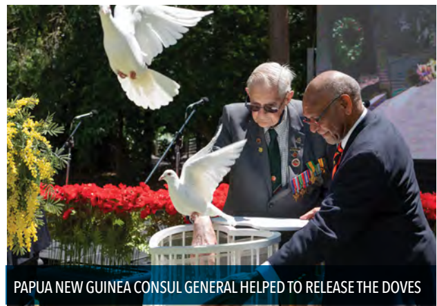
PAPUA NEW GUINEA CONSUL GENERAL HELPED TO RELEASE THE DOVES

The four men were led to their seats with the official party, led by the Burwood RSL sub-Branch Pipes & Drums and children from the neighbouring Concord West pre-school dressed in Kokoda Day T-shirts.