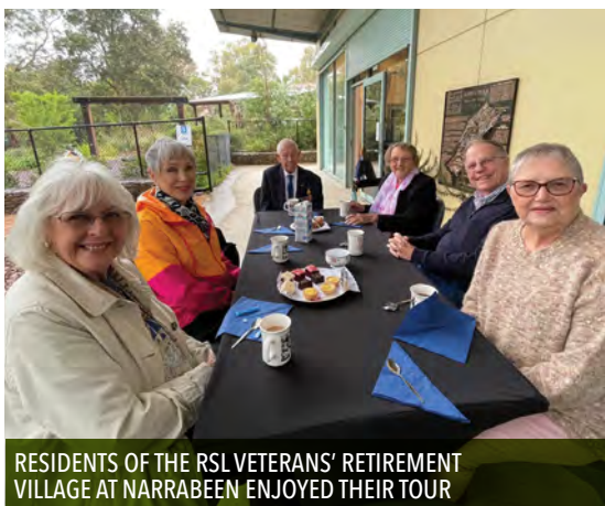
RESIDENTS OF THE RSL VETERANS' RETIREMENT VILLAGE AT NARRABEEN ENJOYED THEIR TOUR