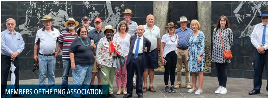
MEMBERS OF THE PNG ASSOCIATION

We have also seen a growth in bookings for our Tours for Communities program. To book a tour for 5 or more people email admin@kokodawalkway.com.au