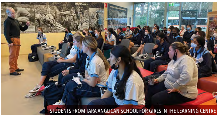
STUDENTS FROM TARA ANGLICAN SCHOOL FOR GIRLS IN THE LEARNING CENTRE