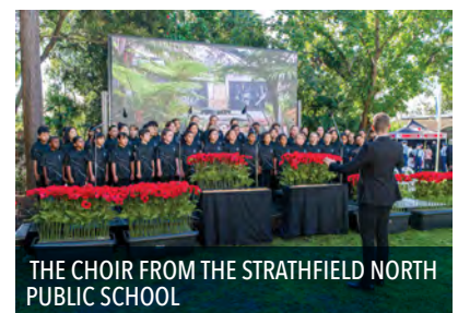
THE CHOIR FROM THE STRATHFIELD NORTH PUBLIC SCHOOL

this memorial and we pay tribute to all concerned, including the nurses who tended the wounded."