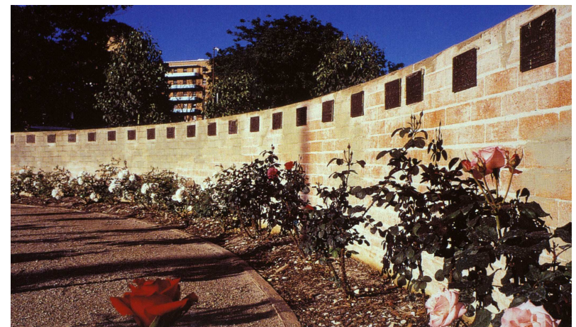
Kokoda Track Memorial Walkway