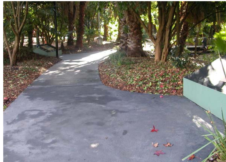
Newly concreted pathway.

To further upgrade the area extra planting was done along the path and mulched. This was required as the original understorey planting had thinned out. The plant species used were a mixture of Australian natives and a species of Rhododendron native to the New Guinea highlands. This particular species of Rhododendron, known as Vireya, thrives in high humidity and a hot summer while flowering prolifically. We are grateful to Ben Richards from City of Canada Bay Council who provided valuable advice and supervised the remediation work .