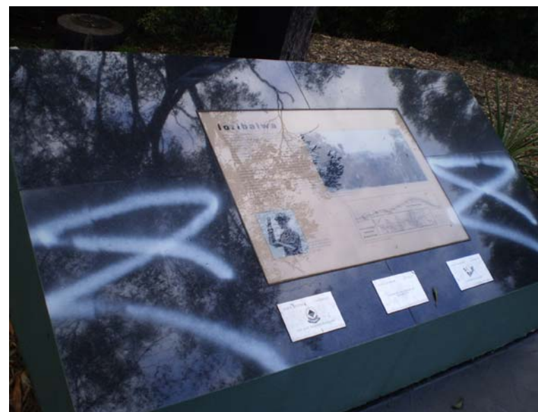
Stations vandalised with graffiti.

We can be thankful to Premier Keneally and Minister Terenzini for giving the Memorial a sum of $10,000 towards repairing the damage.