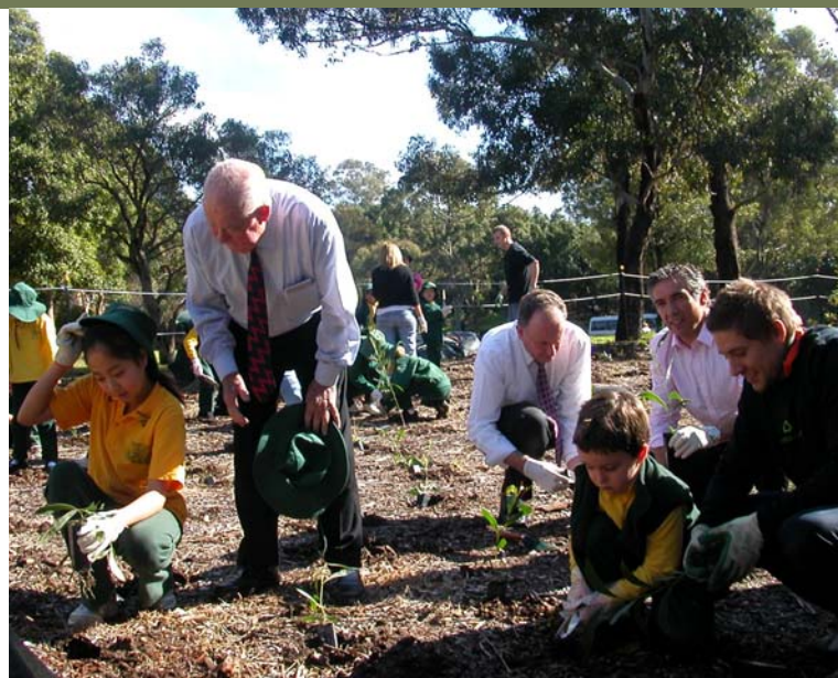
Planting in progress.

Concord West Public School, Canada Bay Council and IKEA at Rhodes have partnered for a three year project in support of the Kokoda Track Memorial Walkway.