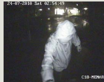
Vandal captured on CCTV.

This sophisticated CCTV system has recently been put to the test (July) following a vicious attack on the memorial. We are pleased that footage retrieved have led to an arrest.