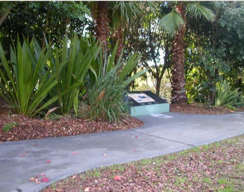
Newly concreted pathway.

In December 2010 the Kokoda Track Memorial Walkway ( KTMW) Board commissioned the Construction Company Paynter Dixon Pty Limited to provide a specification covering all works deemed necessary to replace the original brick paved pathway. They employed Meinhardt Engineers to assist.